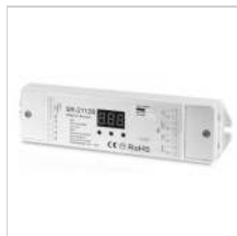
178973 RGBW DMX enabler/decoder 4 channel (0.35A each CH)