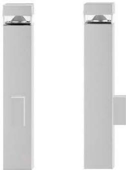
Fixture shown with single gang surface mounted jbox, suitable for GFCI-1 & USB-1

WHEN SPECIFYING USB, PLEASE PROVIDE THE USB TYPE NEEDED, USB-A OR USB-C